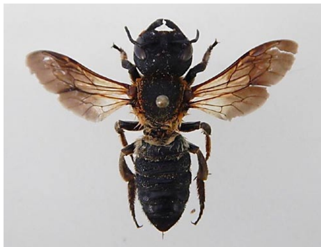
Fig. 2 - Female of Megachile sculpturalis (same specimen as Fig.1) prepared for storage in an entomological collection. - Lo stesso esemplare di Fig. 1 preparato ad arte per la collocazione in una collezione entomologica.

For the identification, one collected female of M. sculpturalis was prepared and mounted on a pin (Figs 1 and 2). Diagnostic keys, images and detailed descriptions of Megachile occurring in Canada were used (SHEFFIELD et al. 2011). Moreover, several scientific papers containing descriptions and illustrations of the species were consulted (HINOJOSA-DÍAZ et al. 2005; HINOJOSA-DÍAZ 2008; VERECKEN & BARBIER 2009; QUARANTA et al. 2014; PRAZ 2017), as well as pictures and comments posted on the internet.