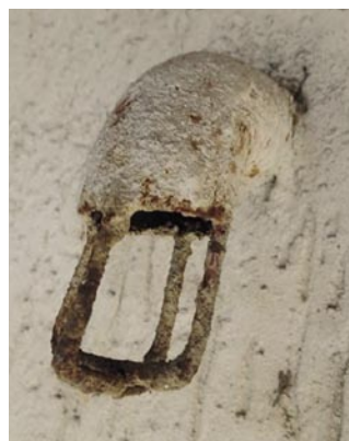
Fig. 4 - Romans d'Isonzo, July 2017. Metal ventilation pipe, emerging from a wall, used for nesting by Megachile sculpturalis .

- Romans d'Isonzo, luglio 2017. Tronco d'albero, presso un muro, con una cavità (nel cerchio rosso) utilizzata per la nidificazione prima da Xylocopa cfr. violacea , poi da Megachile sculpturalis .