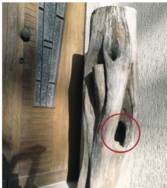
Fig. 3 - Romans d'Isonzo, July 2017. The log, near a wall, with a hollow (in the red circle) used initially for nesting by Xylocopa cfr. violacea , then by Megachile sculpturalis .

Moreover, it will be necessary to investigate the phenomena of competition or aggressive eviction with other pollinating species, such as Xylocopa spp., which has been observed by various researchers in America (LAPORT & MINCKLEY 2012; ROULSTON & MALFI 2012), hypothesized for Europe by some authors (QUARANTA et al. 2014) and also considered in this paper.