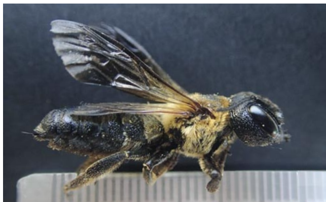
Fig. 1 - Female of Megachile sculpturalis with a metric reference. - Femmina di Megachile sculpturalis con riferimento metrico.

sculpturalis were observed in Hungary in the garden of the Mátra Museum in Gyöngyös (Kovács 2015).